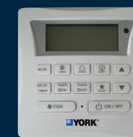
SLM 8 Wired Controller